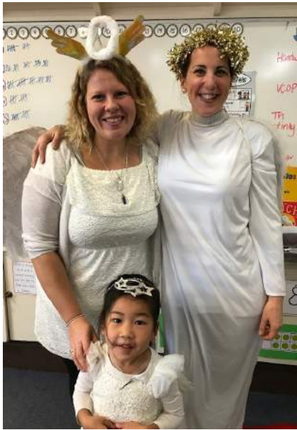
There were many angels, artists, aliens, astronauts and even Audrey Hepburn visiting the school today.

Values: Confidence, Independence, Persistence, Resilience, Respect