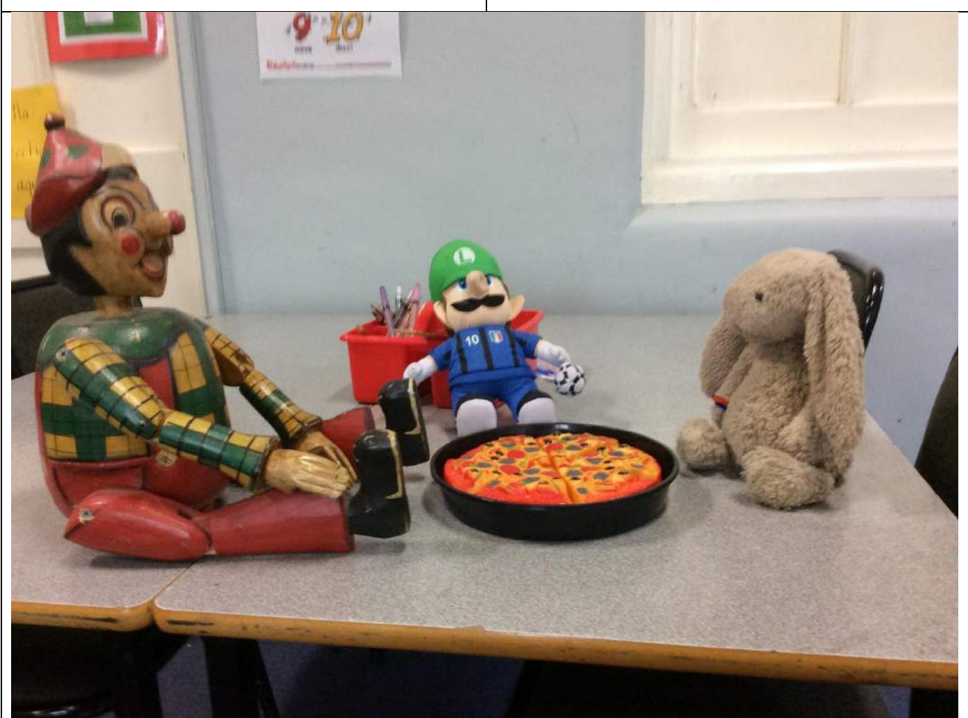
Mischief in the music department.