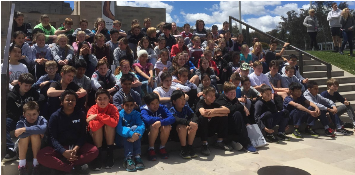
Grade 6 Campers at the Australian War Memorial

There are many different opportunities students at Ivanhoe Primary to participate in to experience new challenges, consolidate their learning and develop new friendships. Here are just a few.