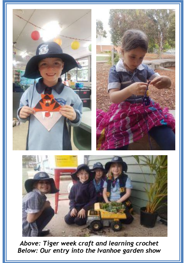
Above: Tiger week craft and learning crochet Below: Our entry into the Ivanhoe garden show

both on the Friday and the Saturday and to those who donated ingredients and rice cookers. It would not have been sothesoraginsuccess it was without your support.