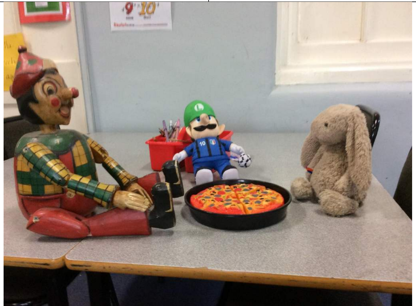
Pizza in the classroom.