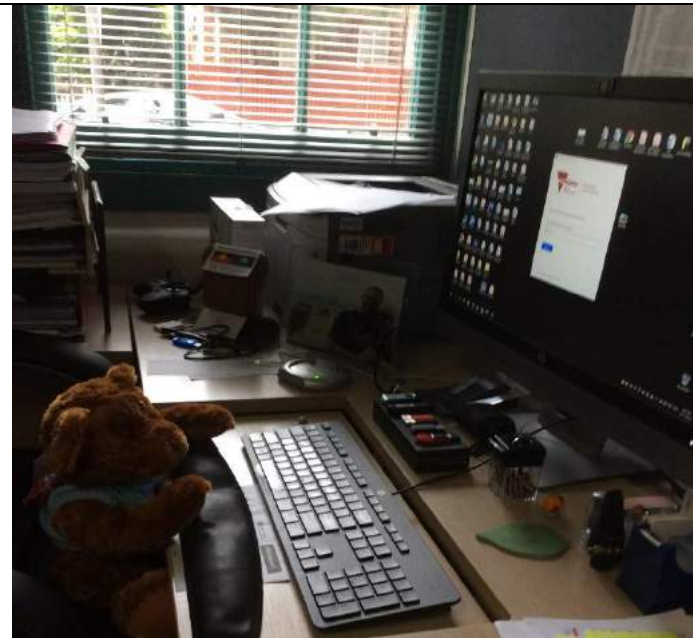
Mischief in the Principal's office.