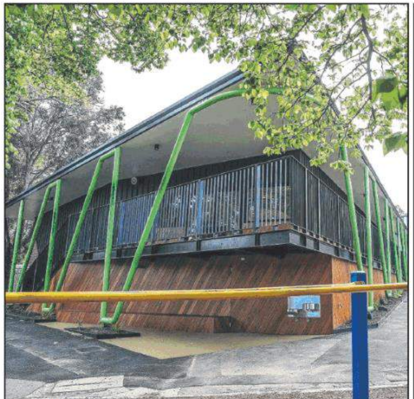
The new Ivanhoe Primary School ‘tree house’.

State Treasurer Tim Pallas and Ivanhoe state Labor MP Anthony Carbines officially opened the “tree house”.