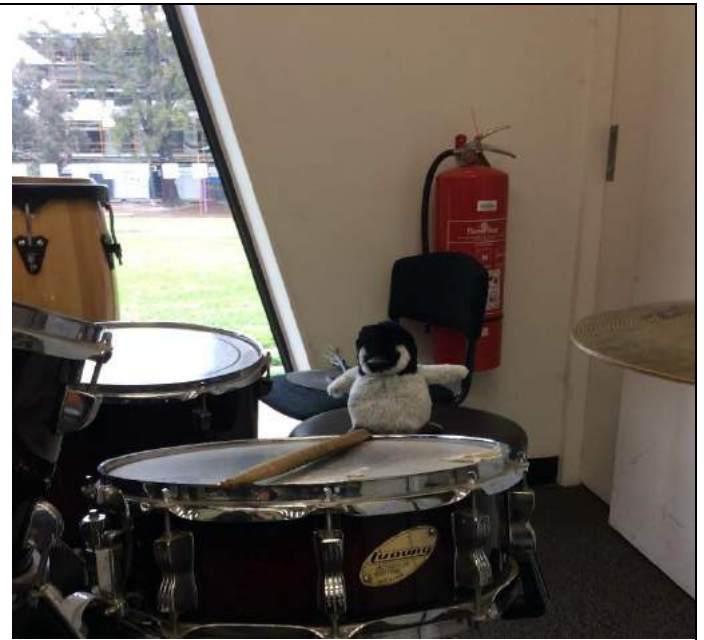
Mischief in the music department.